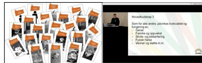
Documentation and communication

Hovedbudskap 3 Som for alle andre, påvirkes livskvalitet og fungering av: - Genar - Familie og oppvekst - Skole- og jobberfaring - Fysisk helse - Venner og støtte m.m.