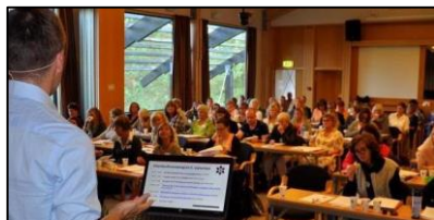
Courses aimed at professionals