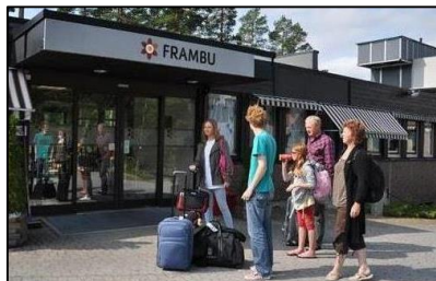
Courses aimed at persons with a rare diagnose and families